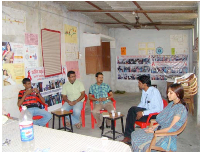
Meeting with an NGO in Uttar Pradesh

No attempt was made to review the quality of the service provision by the range of service providers. A much larger study would be required to achieve a qualitative survey.