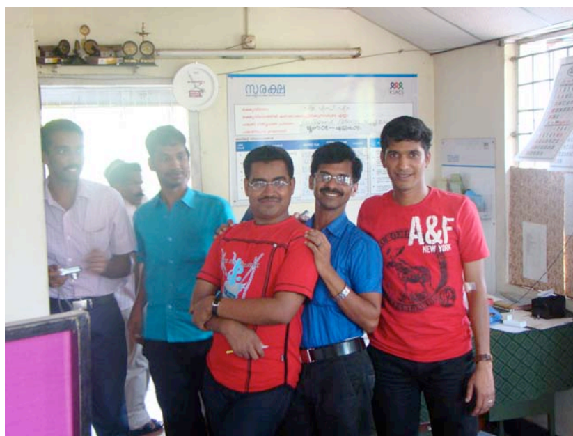
Some of the users of a drop-in centre in Tamilnadu

Of the 108 projects 104 mostly work with males who have sex with males in general, which includes male sex workers, and 4 projects specifically focus their service provision with arvani/hijra communities. which are located in the states of Maharashtra, New Delhi, and Tamilnadu.